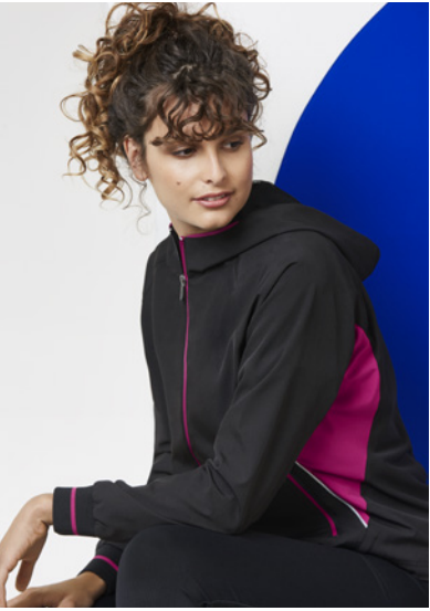
TITAN JACKET Outer Shell: 4-way stretch 94% Polyester, 6% Elastane Lining: 100% Polyester Mesh (Body) Woven (Sleeve)

J920M Mens: XS - 3XL, 5XL J920L Ladies: XS - 2XL J920K Kids: 4/6 - 14