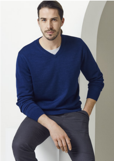
ROMA KNIT 50% Merino Wool, 50% Acrylic - 14 Gauge Machine washable on wool setting

WP916M Mens: XS - 3XL, 5XL LC916L Ladies: XS - 3XL