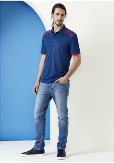
GALAXY POLO 100% BIZ COOL™ Breathable Polyester 155 GSM, UPF rating - Good

P900MS Mens: XS - 3XL, 5XL P900LS Ladies: 6 - 24