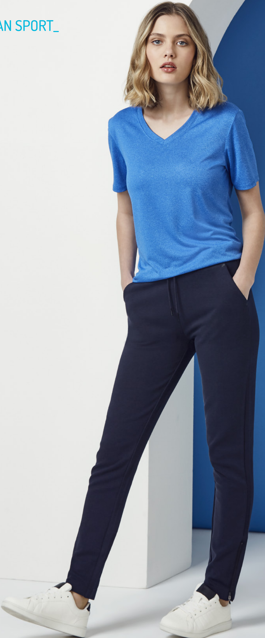
This page T800LS Aero Ladies Tee TP927L Neo Ladies Pant Also available in Mens