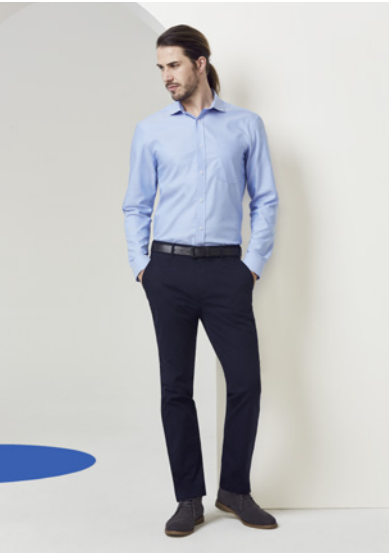
REGENT SHIRT Wrinkle resistant 100% Premium Cotton Yarn dyed subtle herringbone weave

S912ML Mens LS: XS - 5XL S912MS Mens SS: XS - 5XL S912LL Ladies LS: 6 - 24 S912LT Ladies 3/4: 6 - 24 S912LS Ladies SS: 6 - 24