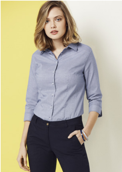
JAGGER SHIRT Easy Care 60% Cotton, 40% Polyester Yarn dyed, cotton-rich, micro houndstooth

S910ML Mens LS: XS - 5XL S910MS Mens SS: XS - 5XL S910LT Ladies 3/4: 6 - 24 S910LS Ladies SS: 6 - 24