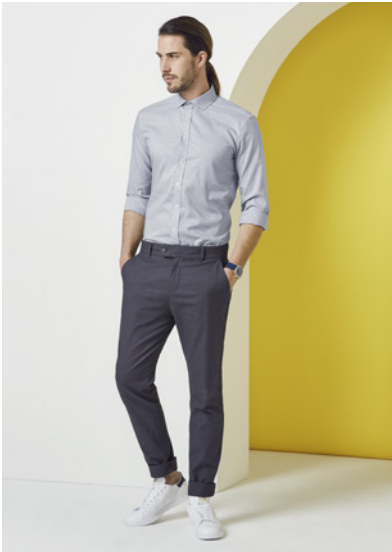
BARLOW PANT 98% Cotton, 2% Elastane stretch Unique jacquard weave cloth made with stretch

BS915M Mens: 72R - 127R BS915L Ladies: 6 - 24