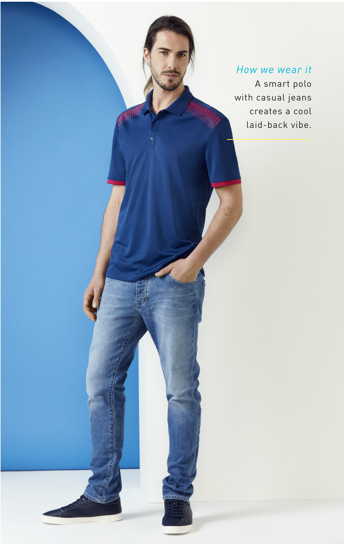
This page P900MS Galaxy Mens Polo Also available in Ladies

A smart polo with casual jeans creates a cool laid-back vibe.