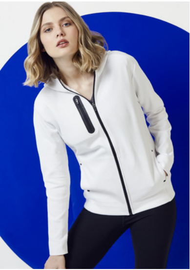
NEO HOODIE Black, White, Navy: 60% Polyester, 40% Cotton Grey Marle: 65% Cotton, 28% Polyester, 7% Viscose

SW926M Mens: XS - 3XL SW926L Ladies: XS - 2XL