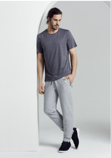
NEO PANT Black, White, Navy: 60% Polyester, 40% Cotton Grey Marle: 65% Cotton, 28% Polyester, 7% Viscose

TP927M Mens: XS - 3XL TP927L Ladies: XS - 2XL