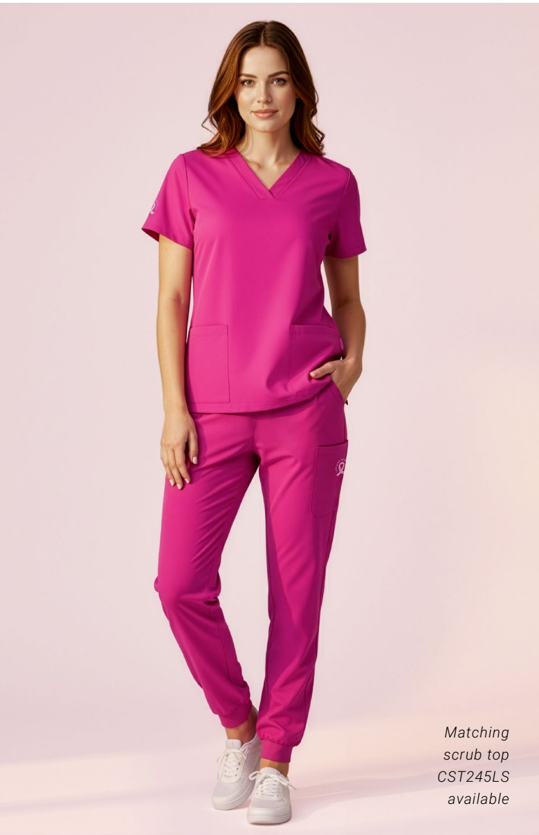
Matching scrub top CST245LS available